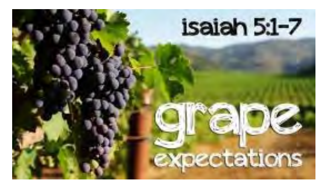
(continued on back page)