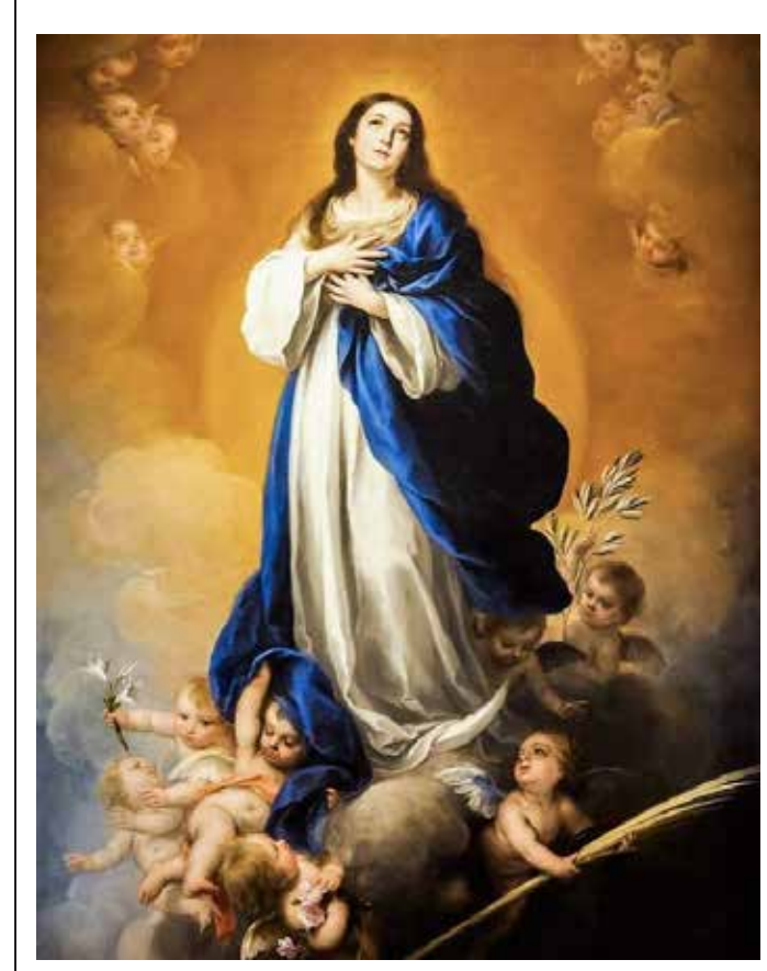
Mass will be held here at St Therese this Monday for the Feast of the Assumption of Mary at 9.30am.